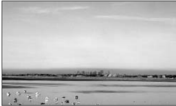
Particles contribute to haze, such as this brown haze over Boston.

A irborne particles, the main ingredient of haze, smoke, and airborne dust, present serious air quality problems in many areas of the United States. This particle pollution can occur year-round—and it can cause a number of serious health problems, even at concentrations found in many major cities.